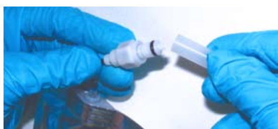
1.) Remove the protective cap from the ink bag valve.