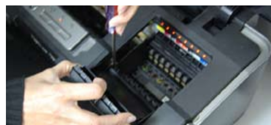
7.) The printer will function properly without the cartridge cover. Remove the cartridge cover by using a flat head screw driver to unclip one side.