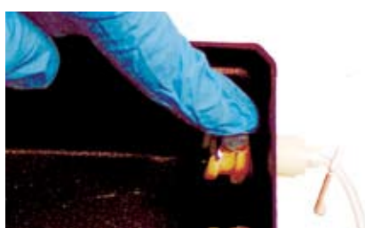
2.) Match each ink bag with the appropriate color label found on the outside of the ink box. Next, push down the metal tab found on the connector located on the inside of the ink box. Then, insert the ink bag valve into the ink box connector. The metal tab will spring up and lock when the connection has been secured.