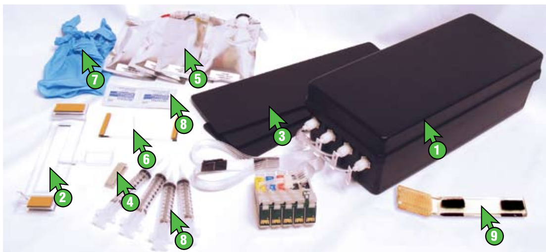
SUBLIJET IQ QUICK CONNECT BULK INK SYSTEM CONTENTS