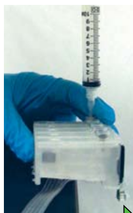
4.) Place the Bulk Cartridge System, tubing down, on top of the ink box with lid. Use care to avoid damaging the chip reset button (see green arrow in picture). Notice how the reset button is not making contact with the ink box. With the syringe plunger pressed down, insert the syringe tip into the septum of the cartridge. Next, slowly extract the plunger. Ink will start to flow through the tubing and into the cartridge. Remove the syringe from the septum when a small amount of ink has filled the syringe tip. Using a separate syringe for each color, repeat the process for the remaining four channels.