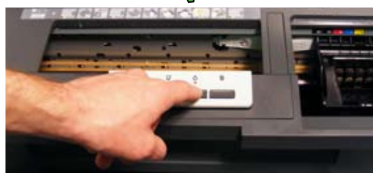
6.) Once the printer has completed initializing, press the ink out button.