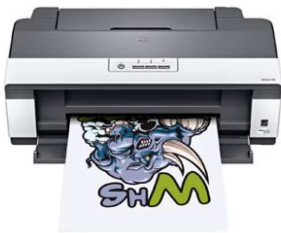
EPSON WORKFORCE 1100 PRINTER

NOTE: Quick Start Guide for WorkForce 1100 only