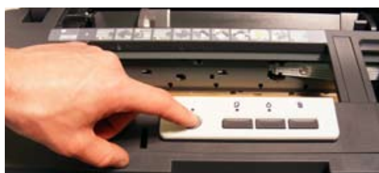
5.) Lift the lid and power on the printer.