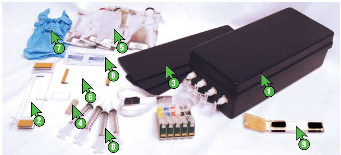
SUBLIJET IQ QUICK CONNECT BULK INK SYSTEM CONTENTS

Check to ensure you have all components shown in the pictures: