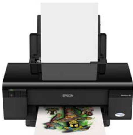
EPSON WORKFORCE 30 PRINTER

NOTE: Quick Start Guide for WorkForce 30 only