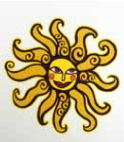
Printed Transfer Paper