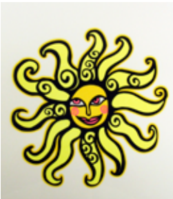
PRESSED TO METAL