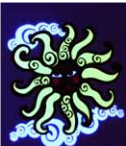
Exposed to Black Light